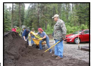
Photos from June 2nd Work Project